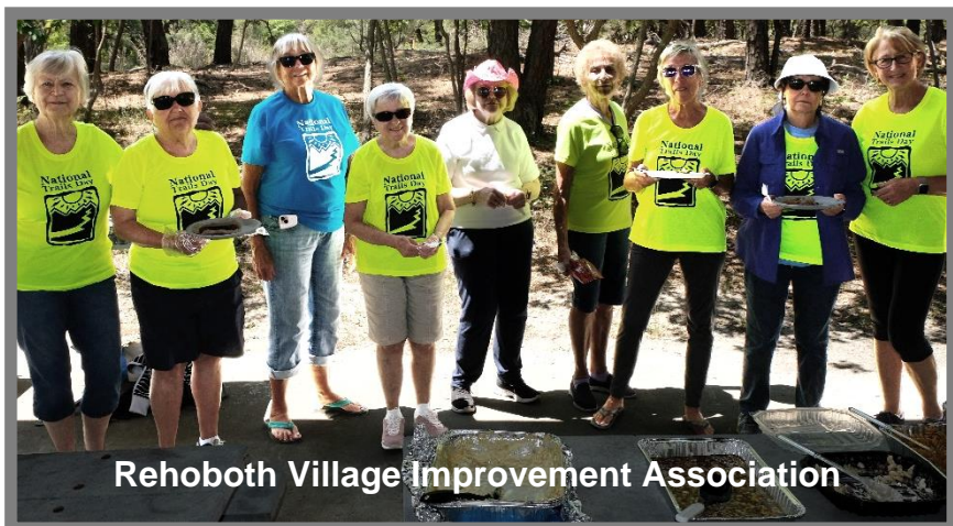
Rehoboth Village Improvement Association